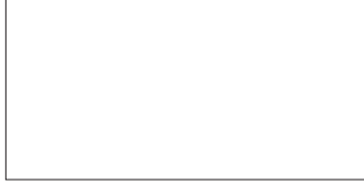
47" x 95"