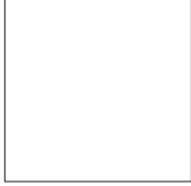
47" x 48"

gloss or chalkboard finish. In minimalist fashion, Aura is frameless with defined corners and sits slightly off the wall, adding a dose of character to any workspace.